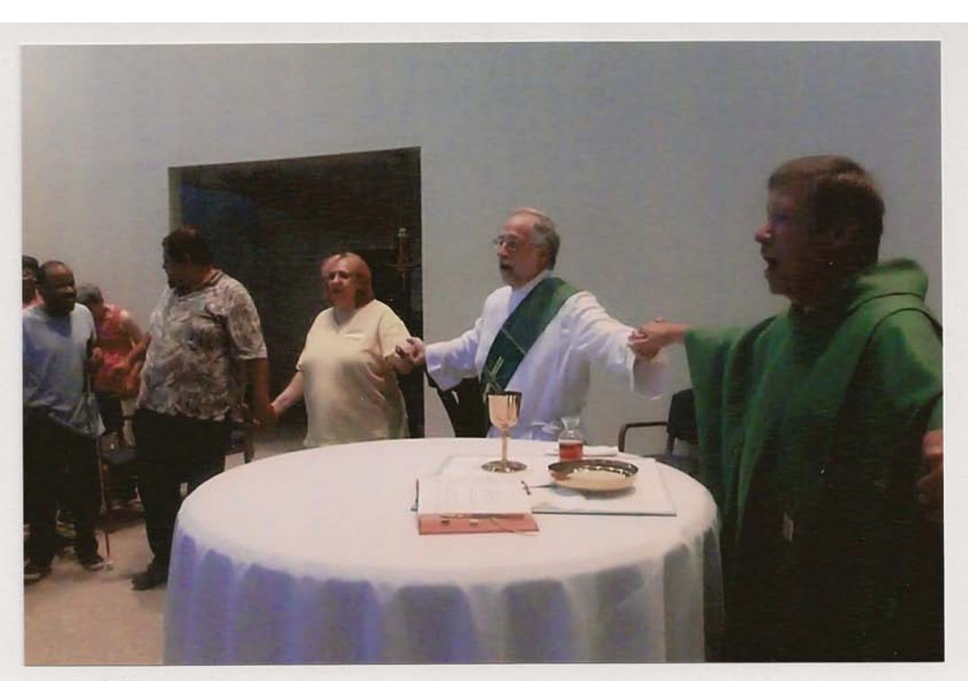
Friends all gather round the Table of the Lord.