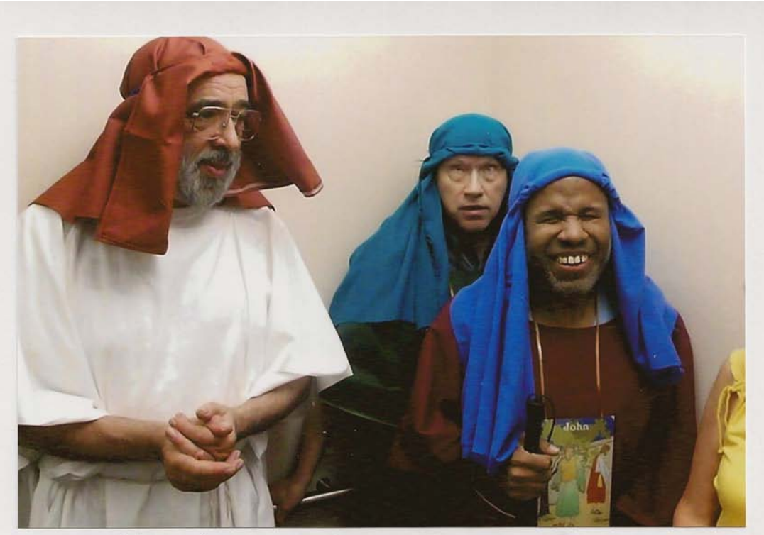
The beggars heard Jesus coming...