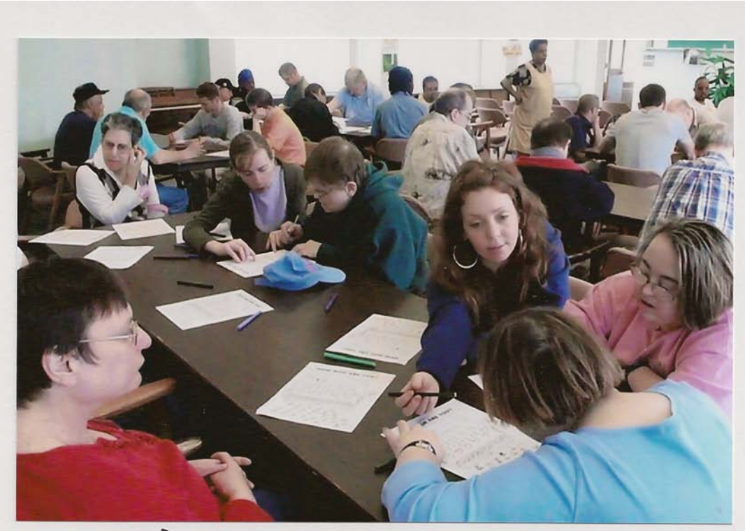
"Where's the clue here?"