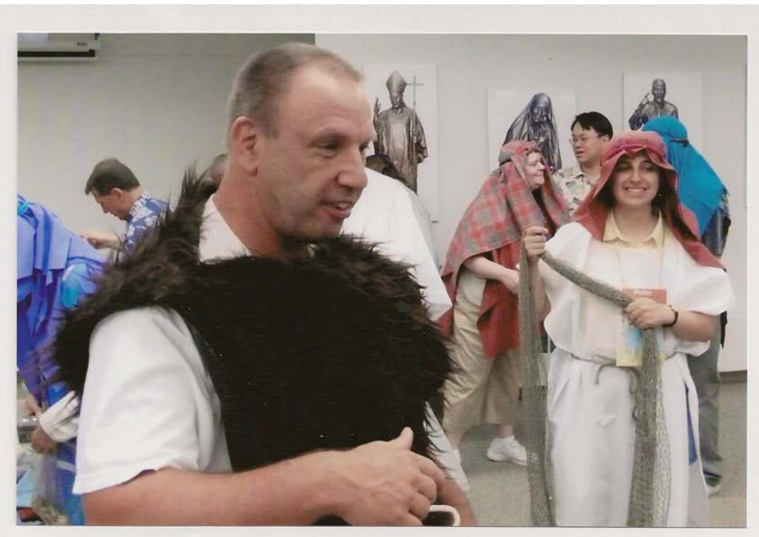
John the Baptist and a fishing friend-