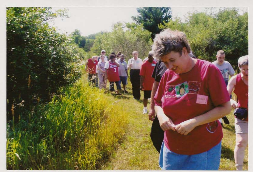
"No, we're not lost!"