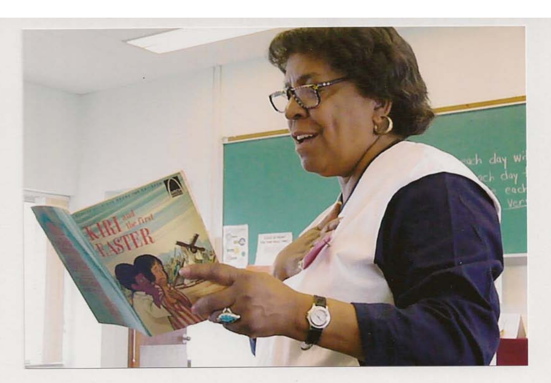
Retreat Director sets the theme with the first story.