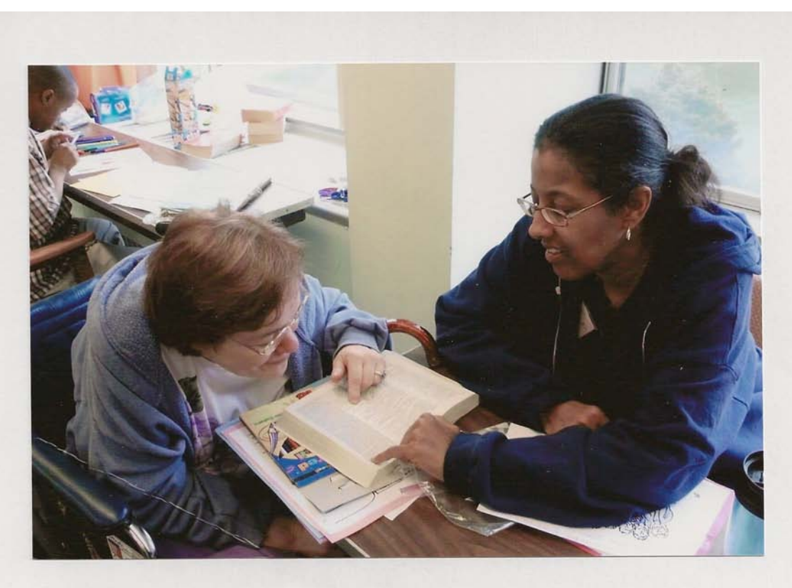
"I CAN find that quote in the Bible!"