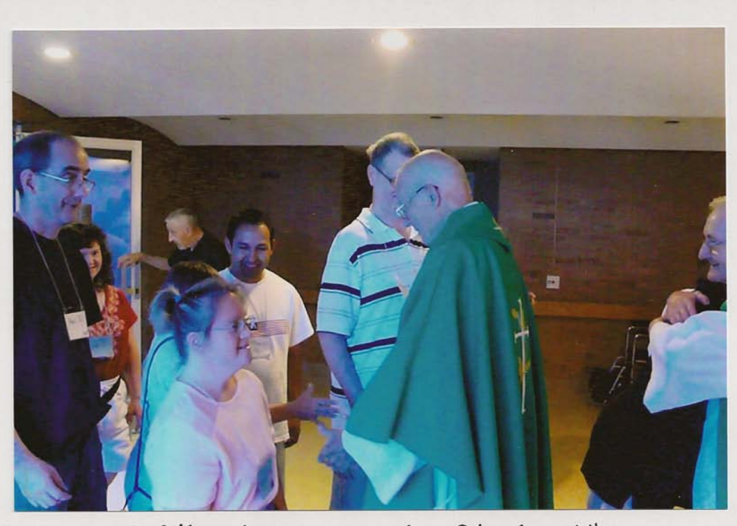
"Thanks so much, Father!"