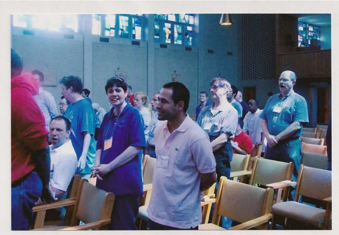
In the Columbiere Chapel