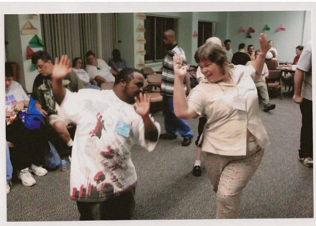
Saturday Night LIVE!