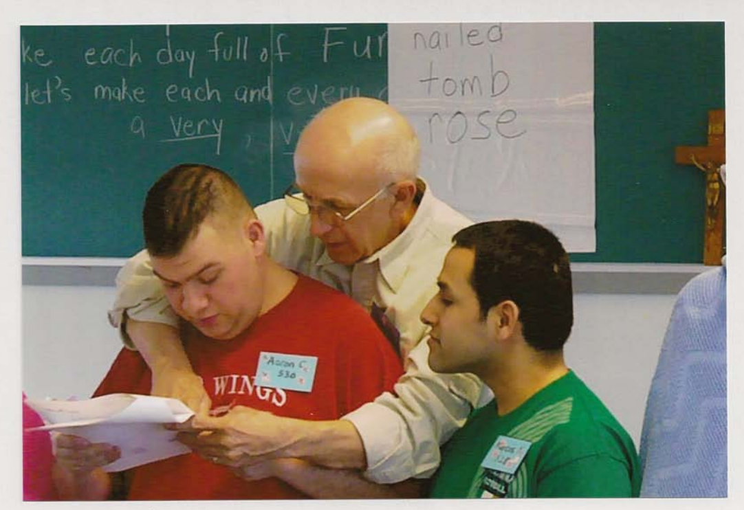
"OK, here's your line in the skit."