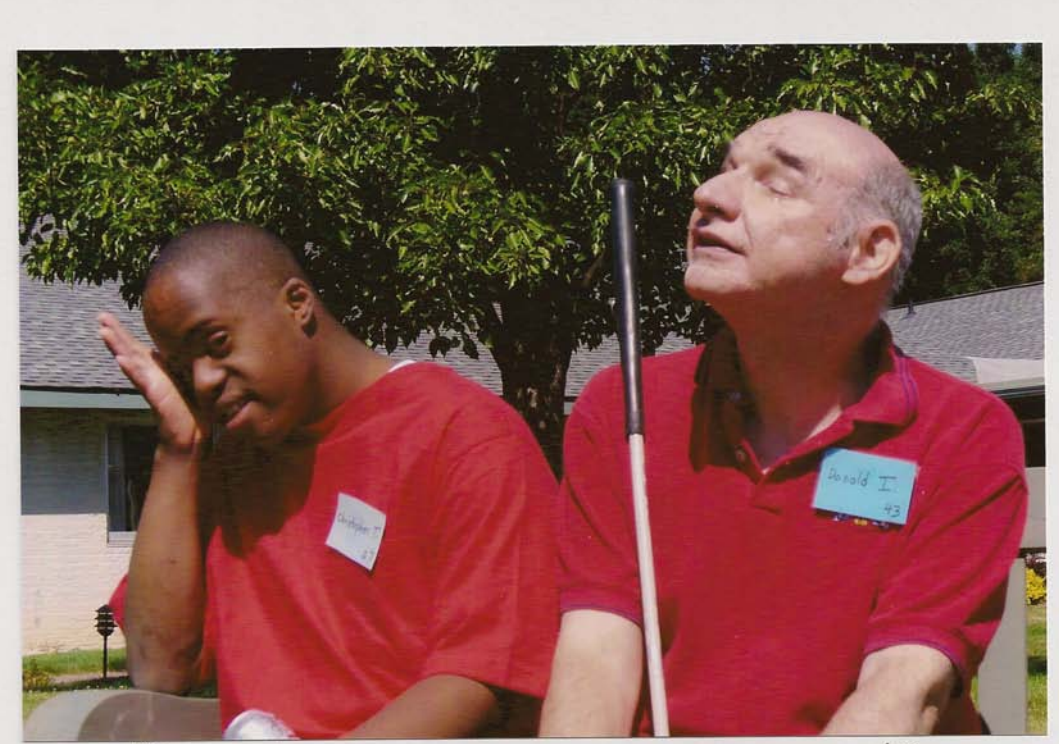
"Oh, the warmth of this sunshine!"